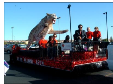
LVHS Alumni (above) and current LVHS students (below) at Homecoming

How great it was to be able to participate in the LVHS Homecoming Parade and halftime activities last October! The Wildcat Float was a big hit with the students, and alumni who participated had a really memorable time! We plan to participate again next October.