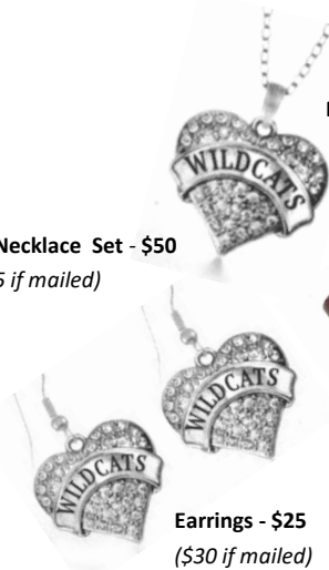
Earrings & Necklace Set - $50 ($55 if mailed)