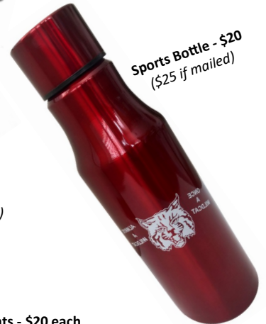
Sports Bottle - $20 ($25 if mailed)