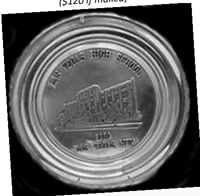
Collector Plates - $100 ($120 if mailed)