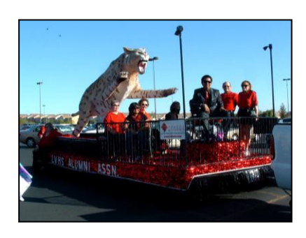
LVHS Alumni (above) and current LVHS students (below) at Homecoming

How great it was to be able to participate in the LVHS Homecoming Parade and halftime activities last October! The Wildcat Float was a big hit with the students, and alumni who participated had a really memorable time! We plan to participate again next October.