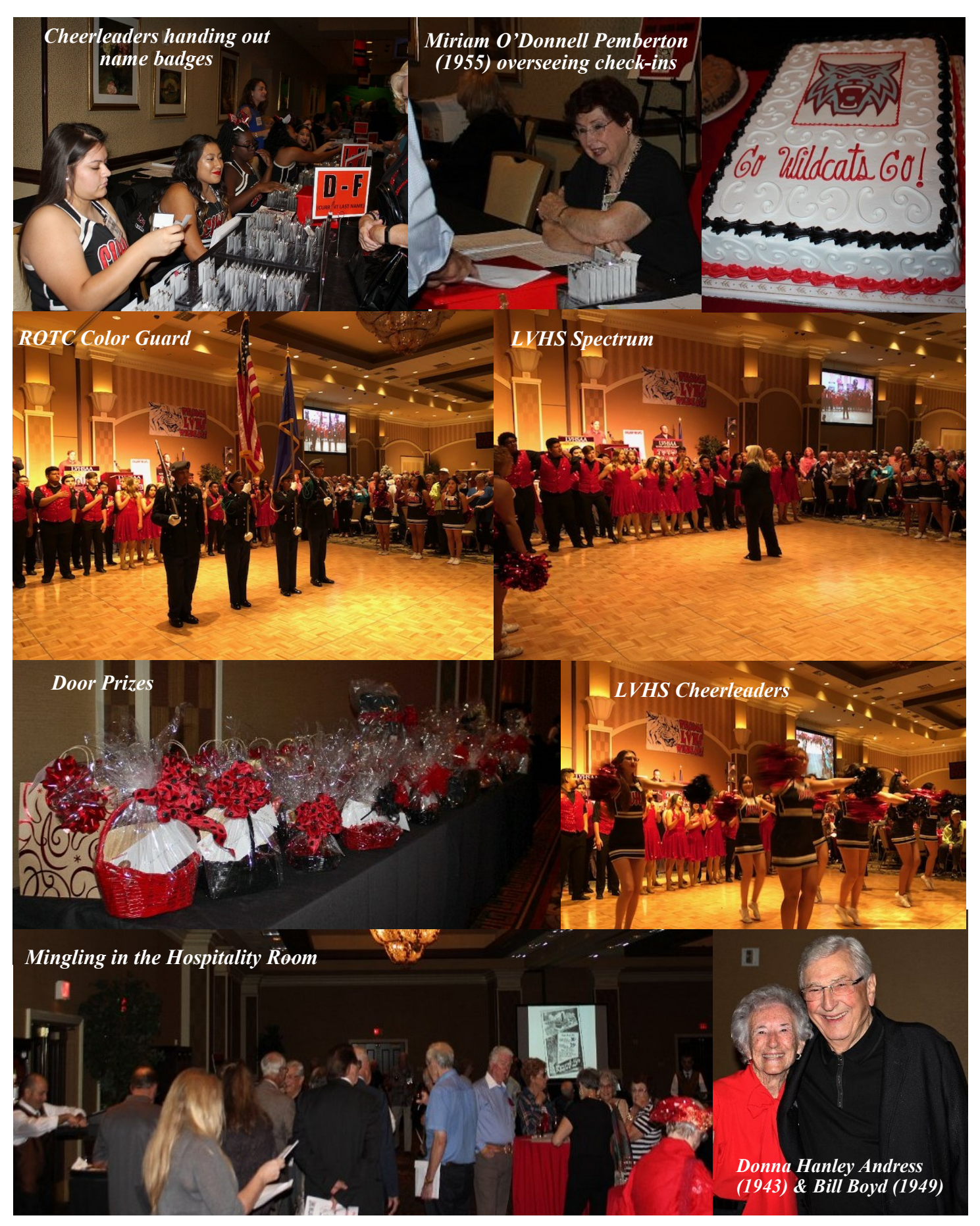
WILDCAT REUNION - September 29, 2018

See more photos on the Wildcat Reunion page of our website: www.lvhsaa.com