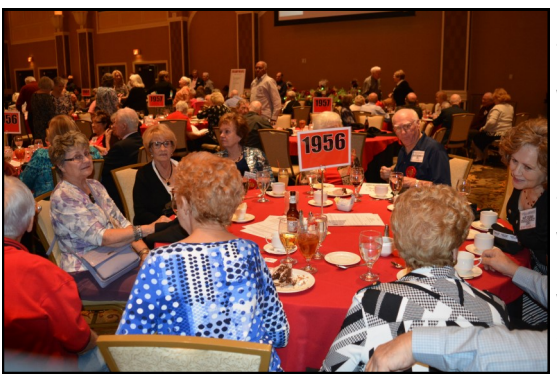
Class of 1956 celebrating at the 2017 Wildcat Reunion