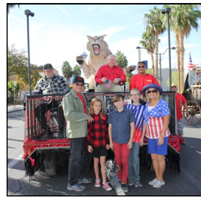
Alumni and Wildcat Float in 2017 Veteran's Day Parade

Our Wildcat float will be in three parades this year - the Summerlin Patriotic Parade on July 4, 2018, the Veterans Day Parade on November 11, 2018, and the LVHS Homecoming Parade in October.