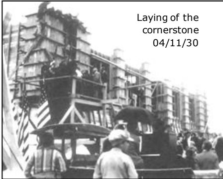
Laying of the cornerstone 04/11/30

In 1928 , with the start of construction of Boulder Dam, the name of the yearbook was changed to "Boulder Echo" and a $5 award was given to the student that named it. There were 24 graduates . Plans were started for a new high school, designed for a student body capacity of 500, at 7 th and Bridger. Many resisted, saying it would be "too far out of town" and would never be filled! There were 29 graduates in 1929 , and 32 in 1930 - the largest class in the history of Las Vegas.